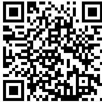
Submit Request for Hearing

Notice: The Official Notice Board (ONB) is still the only official source of information for this regatta.