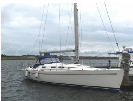
Fig 4. Mother Vessel – 'Chancer' Elan 20'.

A mother vessel will be stationed close to the start / finish area and will be available to competitors who retire or need facilities.