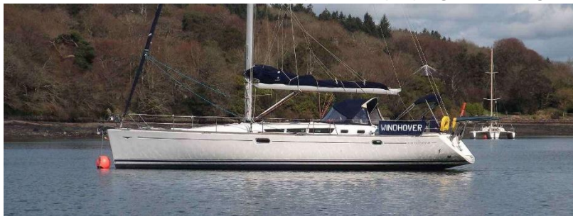
Fig 3. Finish Vessel 'Fiscala' Sun Odyssey 49'

8.1 The finish vessel is between a white sloop yacht displaying a blue flag and a red buoy.