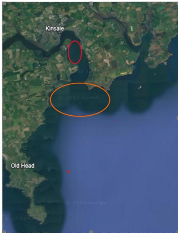
Fig. 1 Indicative race areas.

The area for the Regatta fleets will be in the outer harbour between Charlesfort, the Dock beach and Scilly. See indicative race areas in Fig 1. below: