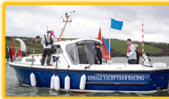
Fig 2. Starting Vessel

7.1 The start is between the red and white pole on the Committee Boat (A white and navy motorboat named "Astra 1" and a red danbuoy displaying a red flag on a pole.