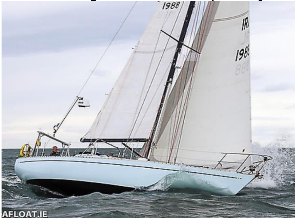
Photo of Finishing Vessel M/V Goblin